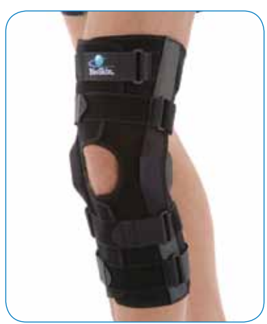
Front closure (DT)