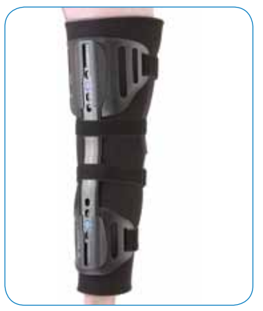
Full foam version