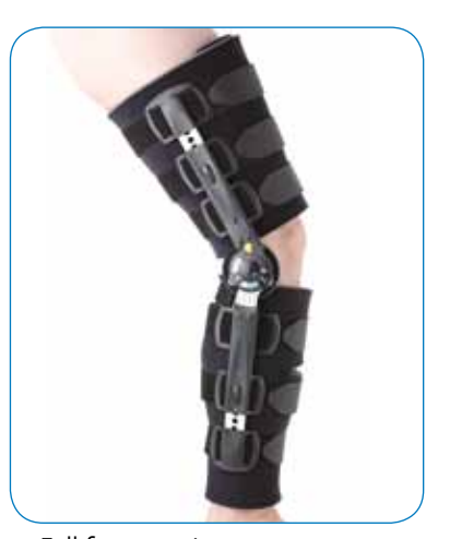
Full foam version