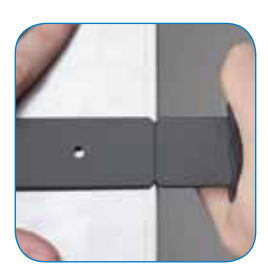
Snap off struts for easy shortening