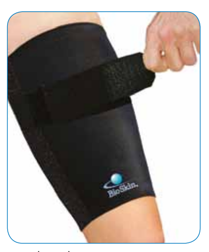
With cinch strap