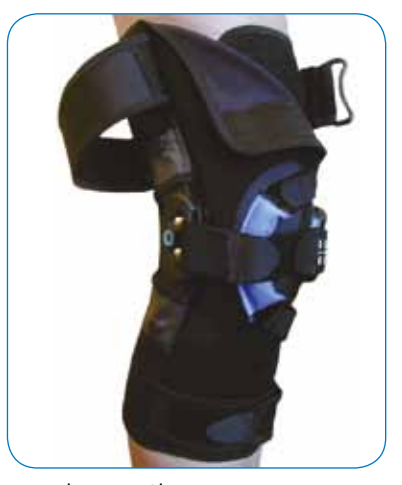
With Front Closure